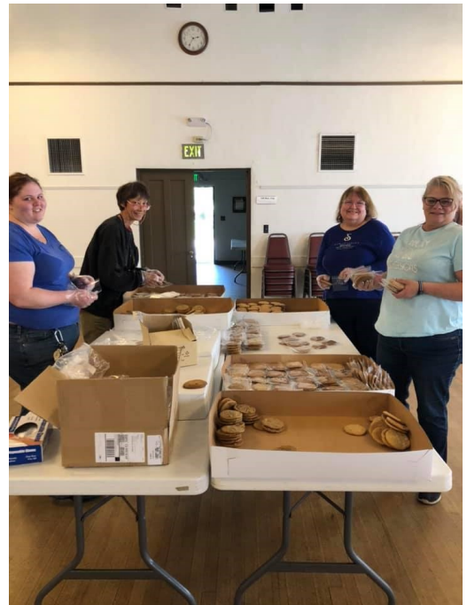
Box lunches being prepared by our ever loyal volunteers!